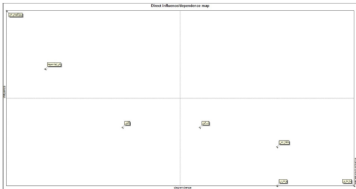
Figure 1. MicMac analysis result

factors with weak and moderate influence on power and dependence. Dependent factors have low influence power but relatively high dependence. These factors are usually targeted or result variables. Linking factors have high guiding power and dependence; influential factors have a high level of influence but low dependence (Malon, 2014).