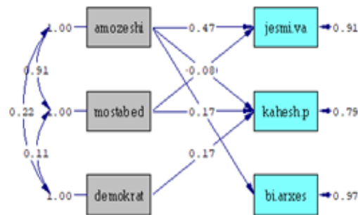
Figure 1. Basic model of liser analysis.

As the model shows, the variables of educational behavior and moderate strength training affect physical-emotional exhaustion and feelings of worthlessness. Democratic behavior affects the feeling of reduced progress. And authoritarian behavior is effective on physical-emotional exhaustion and the feeling of reduced progress. By