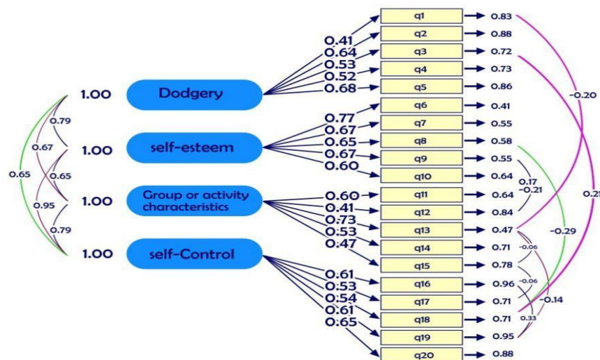
Figure 1. Confirmatory factor analysis of the model for assessing the causes of socio-sports loafing in students in the standard mode

Then, using Kolmogorov-Smirnov test, the normality of data distribution was investigated. According to the significance levels, it was found that the data distribution of factors affecting the incidence of social loafing in students is normal. Parametric tests are used